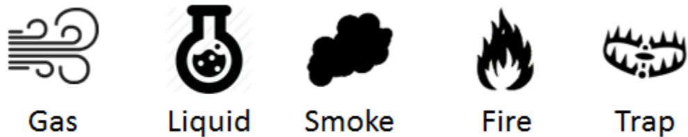
Figure 2 – The types of hazards in Icehouse